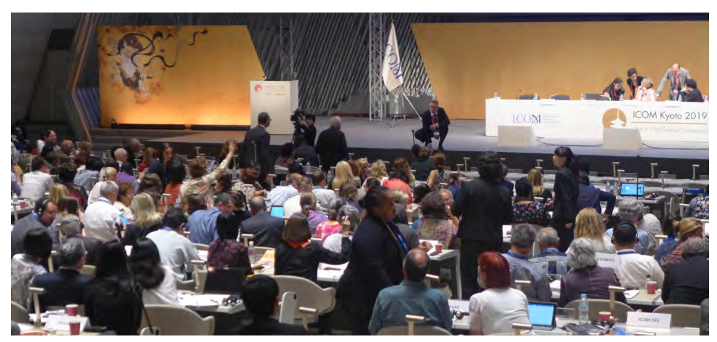
Turbulent scene in Kyoto from the discussion lasting four hours.

the conflict. The nine escalation stages with three levels each, provide information in each case about whether at the beginning of a conflict, the involved persons can and still want to reconcile, or if irreconcilably confrontations increase with only losses on both sides until mutual annihilation.